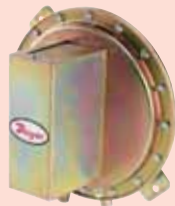
Series 1620 Pressure Switch